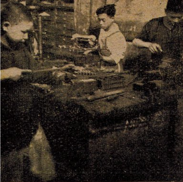
◦ 形 情 機 造 體 全