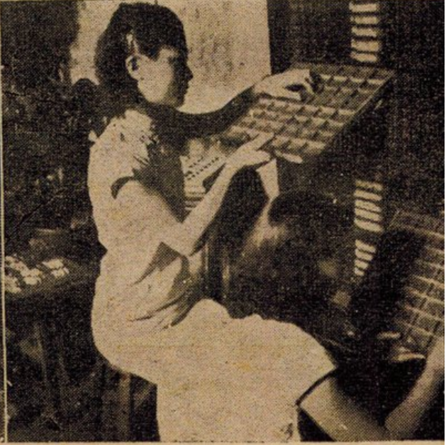
模 鋼 揀